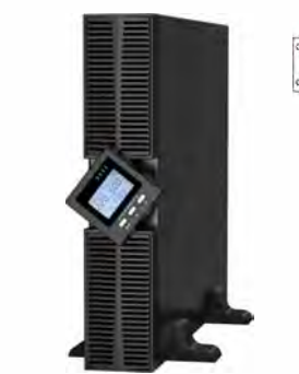
Display panel can be rotated