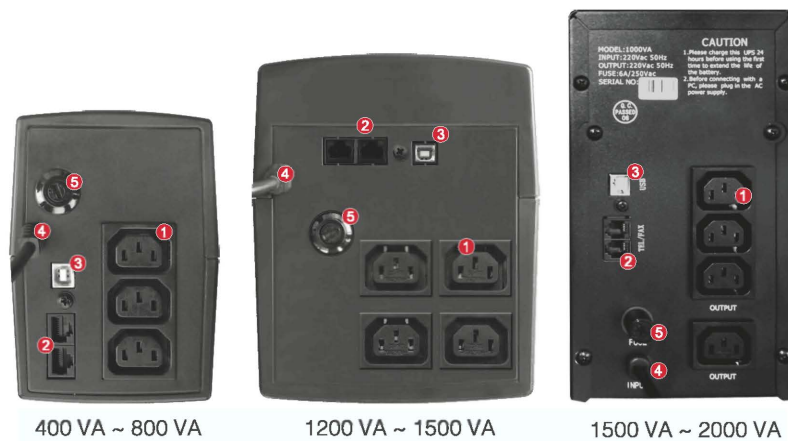
400 VA ~ 800 VA